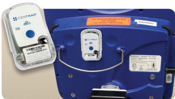
Multi-Mode Asset Tag