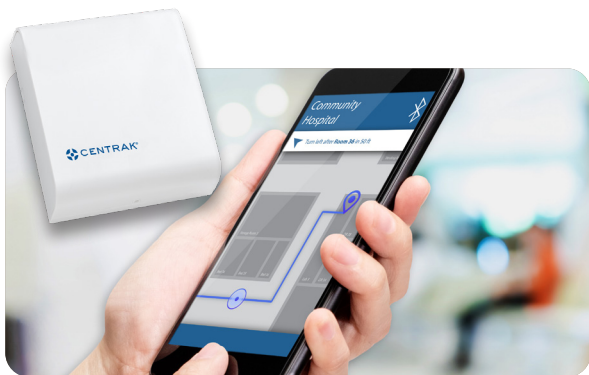
Standalone BLE Beacon