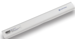
LF Exciter Antenna