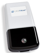
Hand Hygiene Sensor