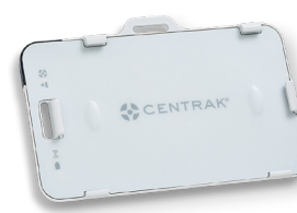
BLE Multi-Mode Badge

Contact Us: www.centrak.com | marketing@centrak.com | 800-515-2928