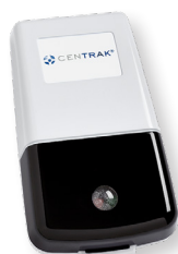
Hand Hygiene Sensor