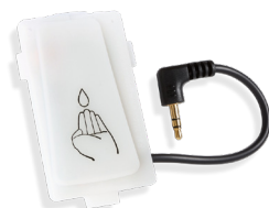
Hand Hygiene Sensor – Embedded