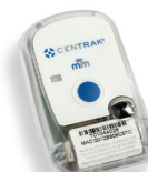
Wi-Fi Multi-Mode Asset Tag